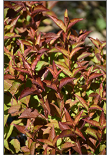
Date Night Strobe Weigela foliage

Date Night Strobe Weigela is recommended for the following landscape applications;