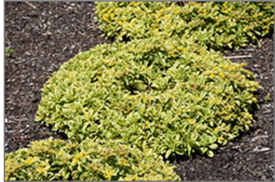
Cutting Edge Stonecrop

Cutting Edge Stonecrop will grow to be only 6 inches tall at maturity, with a spread of 16 inches. When grown in masses or used as a bedding plant, individual plants should be spaced approximately 12 inches apart. Its foliage tends to remain low and dense right to the ground. It grows at a fast rate, and under ideal conditions can be expected to live for approximately 15 years. As an herbaceous perennial, this plant will usually die back to the crown each winter, and will regrow from the base each spring. Be careful not to disturb the crown in late winter when it may not be readily seen!