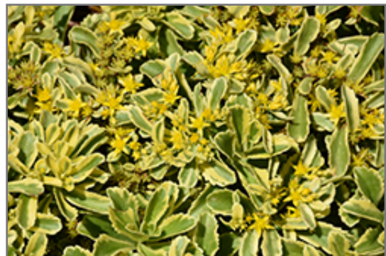
Cutting Edge Stonecrop flowers

Ann Arbor 734-332-7900 155 N. Maple at Jackson