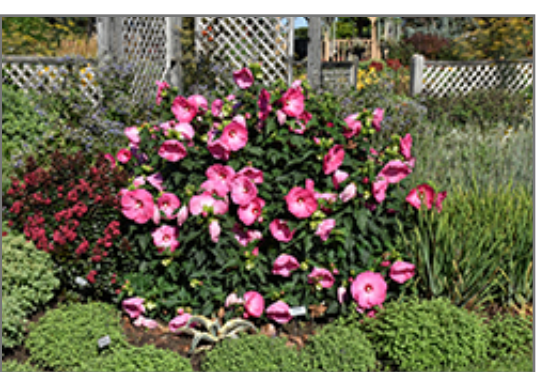
Airbrush Effect Hibiscus in bloom

West Bloomfield 248-851-7506 6370 Orchard Lake Rd.