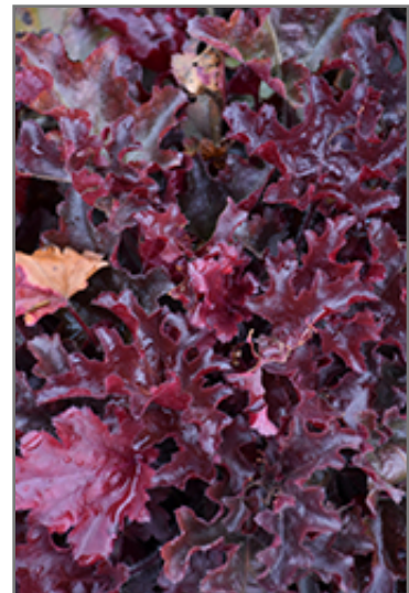
Dolce Cherry Truffles Coral Bells foliage

Ann Arbor 734-332-7900 155 N. Maple at Jackson