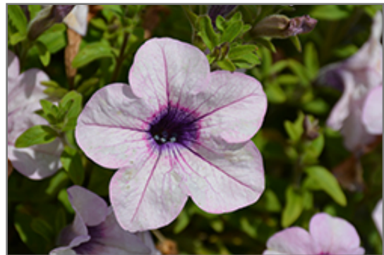
Surfinia Sumo Glacial Pink Petunia flowers

Ann Arbor 734-332-7900 155 N. Maple at Jackson