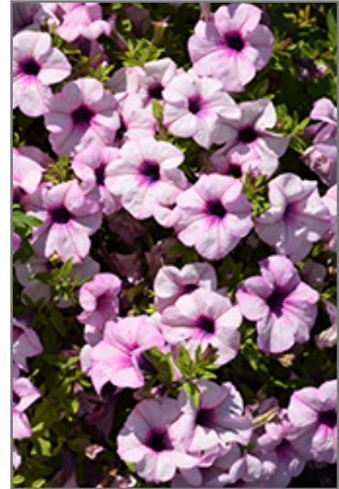
Surfinia Sumo Glacial Pink Petunia flowers

Surfinia Sumo Glacial Pink Petunia is a dense herbaceous annual with a trailing habit of growth, eventually spilling over the edges of hanging baskets and containers. Its medium texture blends into the garden, but can always be balanced by a couple of finer or coarser plants for an effective composition.