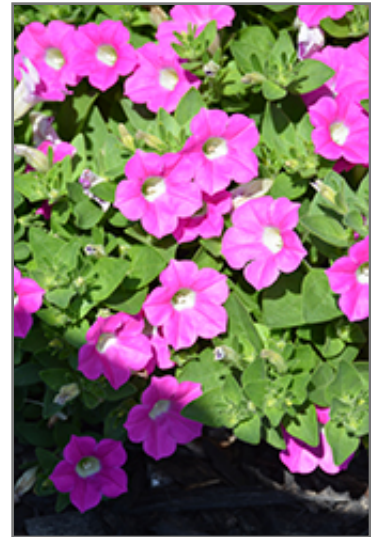
Blanket Rose Petunia flowers

Blanket Rose Petunia is recommended for the following landscape applications;