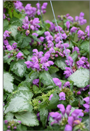
Purple Chablis Spotted Dead Nettle flowers

Purple Chablis Spotted Dead Nettle is recommended for the following landscape applications;