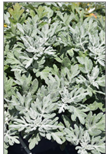
Silver Bullet Dusty Miller foliage