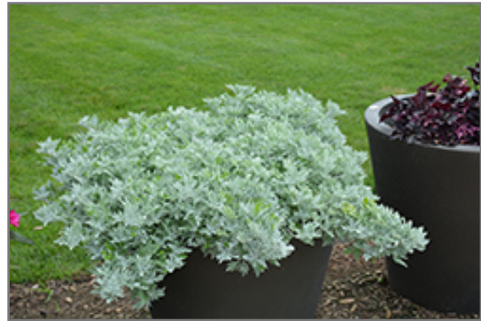
Silver Bullet Dusty Miller

Silver Bullet Dusty Miller will grow to be about 8 inches tall at maturity, with a spread of 24 inches. Its foliage tends to remain low and dense right to the ground. It grows at a fast rate, and under ideal conditions can be expected to live for approximately 10 years. As an herbaceous perennial, this plant will usually die back to the crown each winter, and will regrow from the base each spring. Be careful not to disturb the crown in late winter when it may not be readily seen!