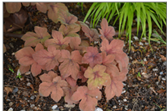
Pumpkin Spice Foamy Bells

Ann Arbor 734-332-7900 155 N. Maple at Jackson