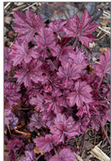
Wild Rose Coral Bells foliage