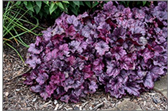
Wild Rose Coral Bells

Wild Rose Coral Bells is a dense herbaceous evergreen perennial with tall flower stalks held atop a low mound of foliage. Its relatively coarse texture can be used to stand it apart from other garden plants with finer foliage.