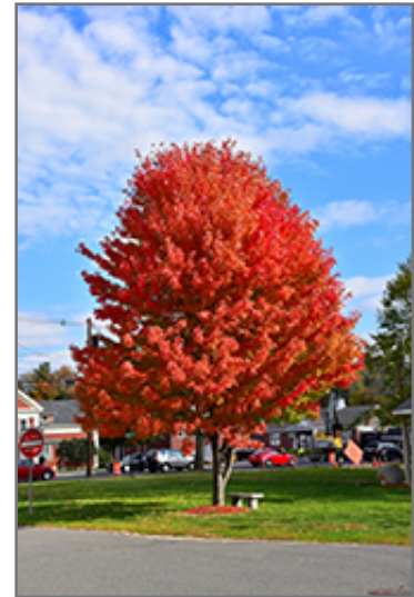
Autumn Splendor Sugar Maple in fall