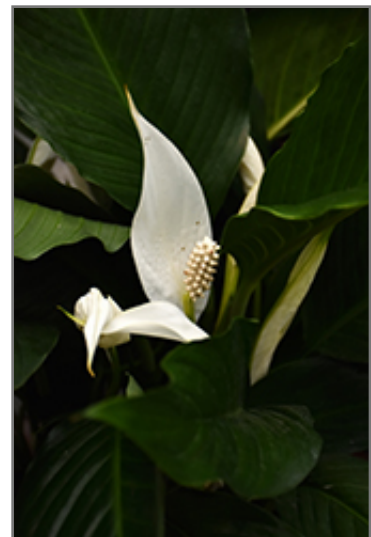
Peace Lily flowers