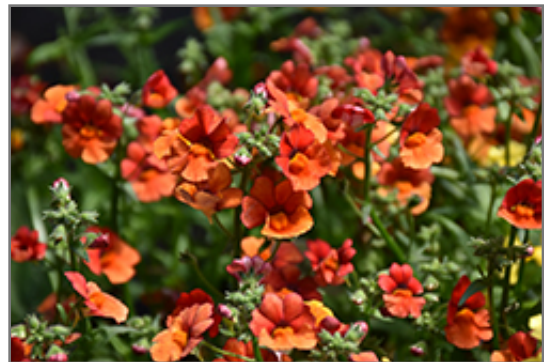
Sunsatia Blood Orange Nemesia flowers