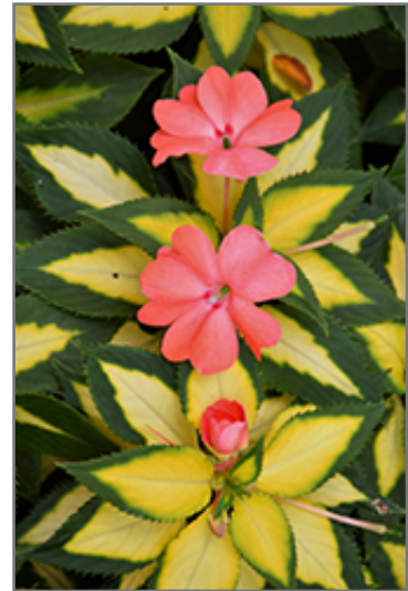
SunPatiens Spreading Salmon New Guinea Impatiens flowers

This plant will require occasional maintenance and upkeep, and should not require much pruning, except when necessary, such as to remove dieback. It is a good choice for attracting bees and butterflies to your yard. It has no significant negative characteristics.