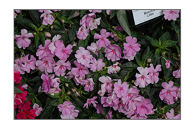
Bounce Lilac Impatiens flowers

Royal Oak 248-280-9500 4901 Coolidge Rd.