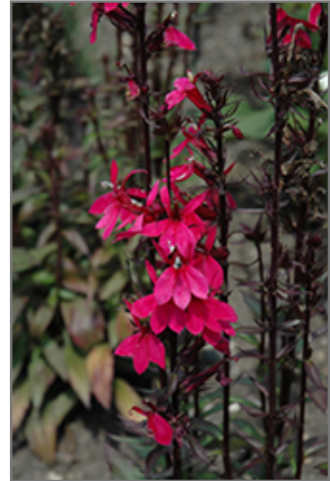
Starship Deep Rose Lobelia flowers

Starship Deep Rose Lobelia is recommended for the following landscape applications;