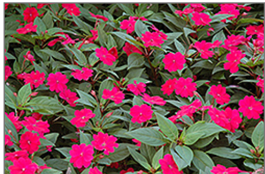
Bounce Cherry Impatiens in bloom