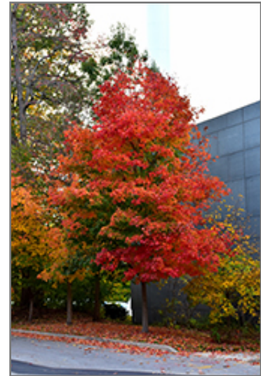
Fall Fiesta Sugar Maple in fall