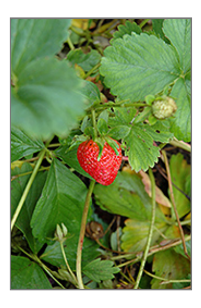
Eclair Strawberry fruit

This is an open herbaceous perennial with a spreading, ground-hugging habit of growth. Its relatively fine texture sets it apart from other garden plants with less refined foliage. This is a high maintenance plant that will require regular care and upkeep, and should not require much pruning, except when necessary, such as to remove dieback. It is a good choice for attracting birds to your yard, but is not particularly attractive to deer who tend to leave it alone in favor of tastier treats. Gardeners should be aware of the following characteristic(s) that may warrant special consideration;