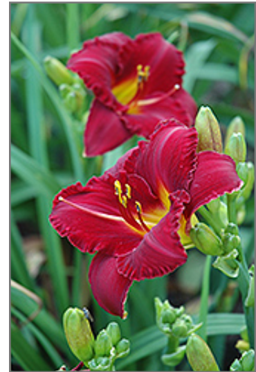
Pygmy Prince Daylily flowers