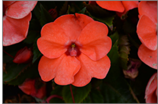
SunPatiens Compact Hot Coral New Guinea Impatiens flowers

This plant will require occasional maintenance and upkeep, and should not require much pruning, except when necessary, such as to remove dieback. It is a good choice for attracting bees and butterflies to your yard. It has no significant negative characteristics.