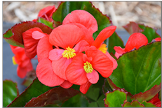
Big Red Green Leaf Begonia flowers

This is a high maintenance plant that will require regular care and upkeep, and usually looks its best without pruning, although it will tolerate pruning. Deer don't particularly care for this plant and will usually leave it alone in favor of tastier treats. Gardeners should be aware of the following characteristic(s) that may warrant special consideration;