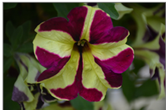
Crazytunia Knight Rider Petunia flowers