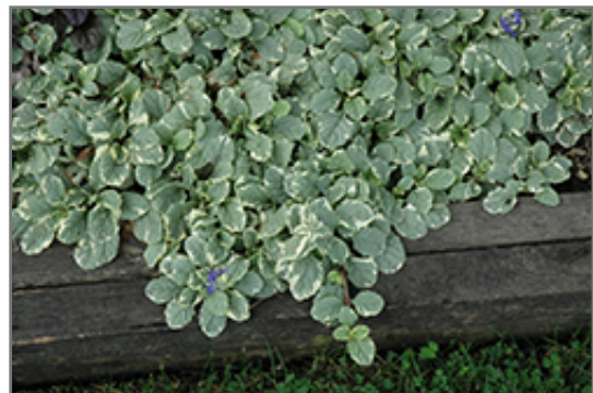
Silver Queen Bugleweed