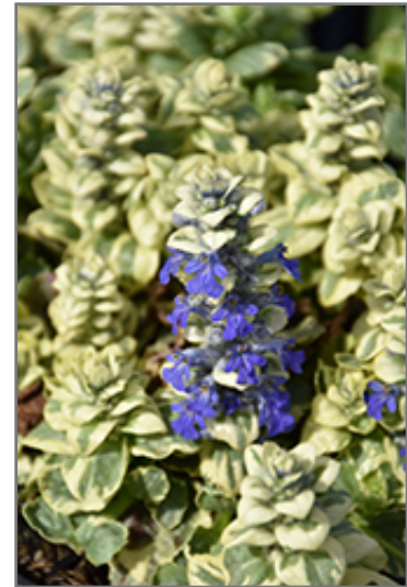
Silver Queen Bugleweed flowers

Silver Queen Bugleweed is a dense herbaceous evergreen perennial with a ground-hugging habit of growth. Its medium texture blends into the garden, but can always be balanced by a couple of finer or coarser plants for an effective composition.