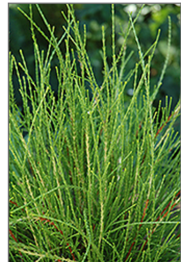
Franky Boy Arborvitae foliage