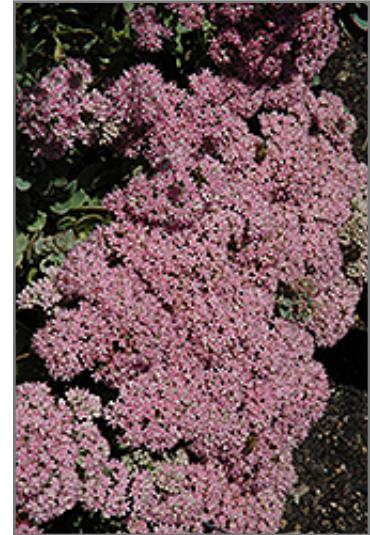
Lime Zinger Stonecrop flowers

This is a relatively low maintenance plant, and is best cleaned up in early spring before it resumes active growth for the season. It is a good choice for attracting bees and butterflies to your yard, but is not particularly attractive to deer who tend to leave it alone in favor of tastier treats. It has no significant negative characteristics.