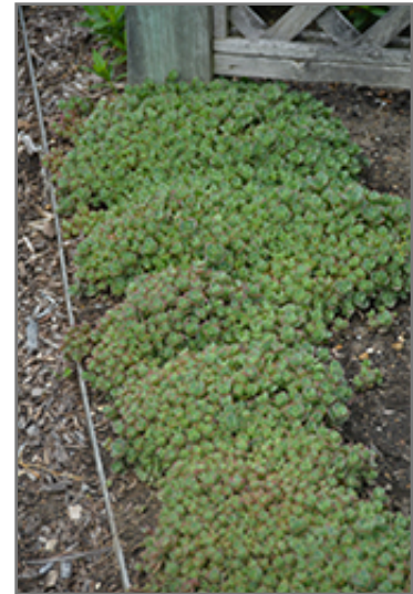
Lime Zinger Stonecrop

Lime Zinger Stonecrop will grow to be only 4 inches tall at maturity extending to 6 inches tall with the flowers, with a spread of 18 inches. When grown in masses or used as a bedding plant, individual plants should be spaced approximately 15 inches apart. Its foliage tends to remain low and dense right to the ground. It grows at a fast rate, and under ideal conditions can be expected to live for approximately 15 years. As an herbaceous perennial, this plant will usually die back to the crown each winter, and will regrow from the base each spring. Be careful not to disturb the crown in late winter when it may not be readily seen!