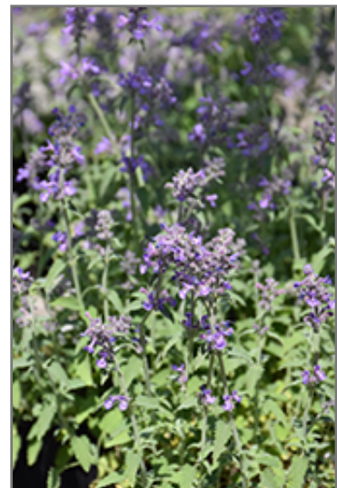
Little Trudy Catmint flowers