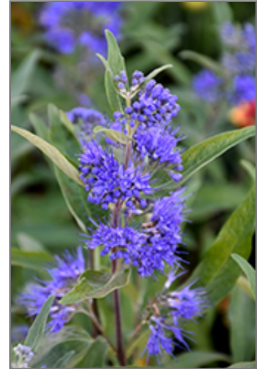
Sapphire Surf Caryopteris flowers

Sapphire Surf Caryopteris is recommended for the following landscape applications;