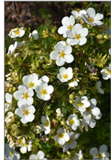
McKay's White Potentilla flowers