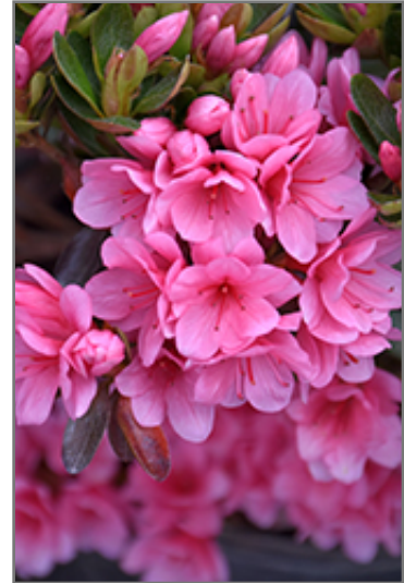
Coral Bells Azalea flowers