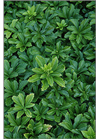
Green Sheen Japanese Spurge foliage