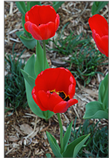
Parade Tulip flowers