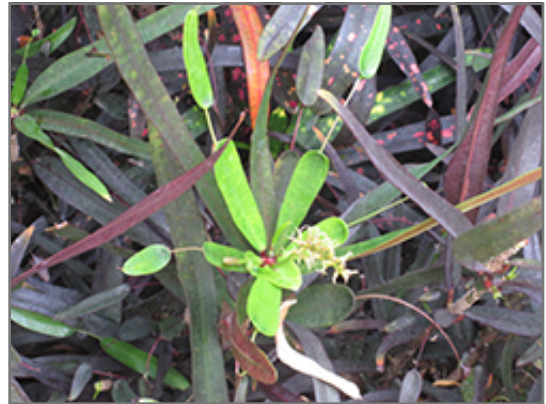
Mother And Daughter Croton flowers

This is a dense herbaceous evergreen houseplant with an upright spreading habit of growth. Its wonderfully bold, coarse texture is quite ornamental and should be used to full effect. This plant should not require much pruning, except when necessary to keep it looking its best.