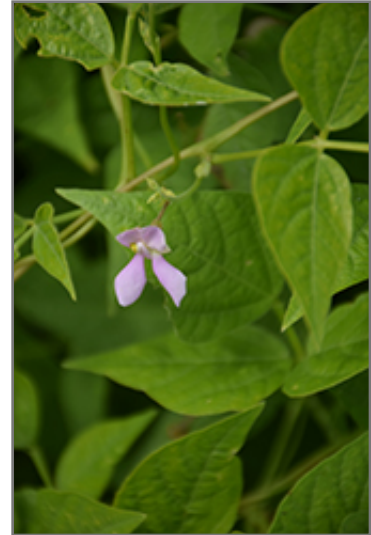
Golden Wax Bean flowers

Golden Wax Bean will grow to be about 10 feet tall at maturity, with a spread of 24 inches. When planted in rows, individual plants should be spaced approximately 12 inches apart. Because of its vigorous growth habit, it may require staking or supplemental support. This fast-growing vegetable plant is an annual, which means that it will grow for one season in your garden and then die after producing a crop. Because of its relatively short time to maturity, it lends itself to a series of successive plantings each staggered by a week or two; this will prolong the effective harvest period.