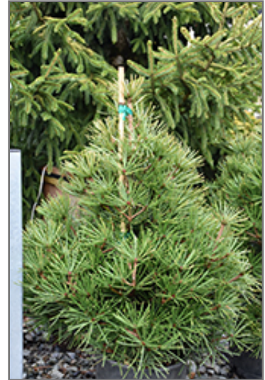
Picola Umbrella Pine

Picola Umbrella Pine is recommended for the following landscape applications;