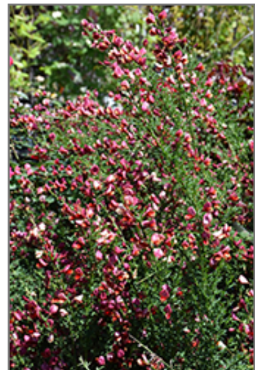
Sister Rosie Scotch Broom flowers

Ann Arbor 734-332-7900 155 N. Maple at Jackson