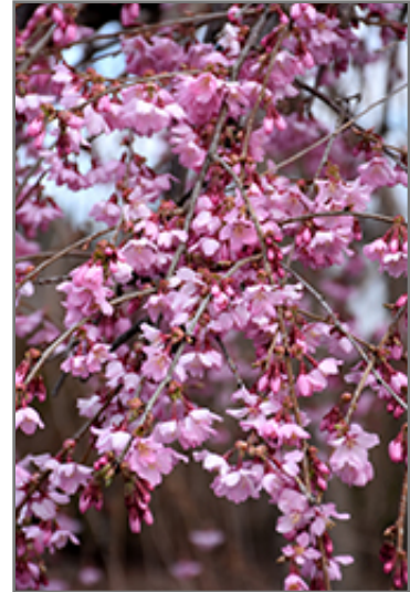
Pink Cascade Weeping Cherry flowers

Pink Cascade Weeping Cherry is recommended for the following landscape applications;