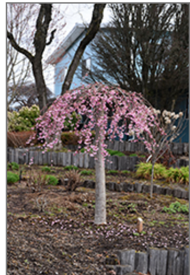
Pink Cascade Weeping Cherry in bloom