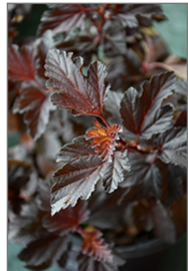
Fireside Ninebark flowers