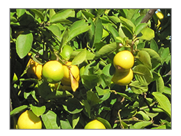
Persian Lime fruit