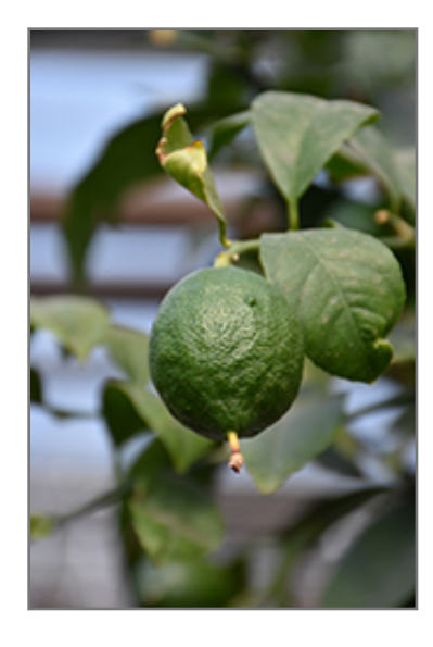
Persian Lime fruit

Persian Lime features showy clusters of fragrant white star-shaped flowers with yellow eyes at the ends of the branches from late winter to early spring. It has attractive dark green evergreen foliage. The glossy oval leaves are highly ornamental and remain dark green throughout the winter. It features an abundance of magnificent green berries in mid summer.