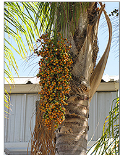
Queen Palm fruit