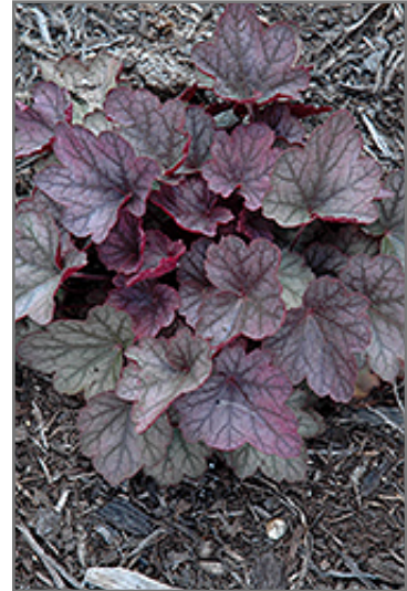
Carnival Rose Granita Coral Bells foliage

Carnival Rose Granita Coral Bells is recommended for the following landscape applications;