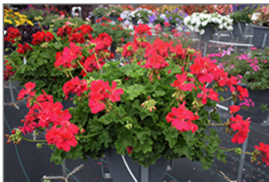
Boldly Hot Pink Geranium in bloom

Ann Arbor 734-332-7900 155 N. Maple at Jackson