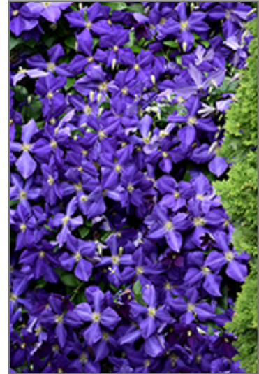
Jackmanii Clematis in bloom