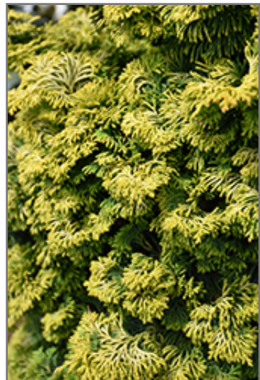
Dwarf Golden Hinoki Falsecypress foliage

Ann Arbor 734-332-7900 155 N. Maple at Jackson