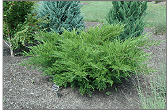
Sea Green Juniper