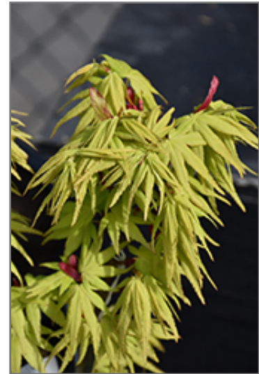
Mikawa Yatsubusa Japanese Maple foliage

Mikawa Yatsubusa Japanese Maple is recommended for the following landscape applications;