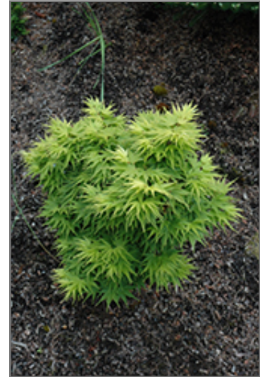
Mikawa Yatsubusa Japanese Maple

Mikawa Yatsubusa Japanese Maple is a fine choice for the yard, but it is also a good selection for planting in outdoor pots and containers. With its upright habit of growth, it is best suited for use as a 'thriller' in the 'spiller-thriller-filler' container combination; plant it near the center of the pot, surrounded by smaller plants and those that spill over the edges. It is even sizeable enough that it can be grown alone in a suitable container. Note that when grown in a container, it may not perform exactly as indicated on the tag - this is to be expected. Also note that when growing plants in outdoor containers and baskets, they may require more frequent waterings than they would in the yard or garden.