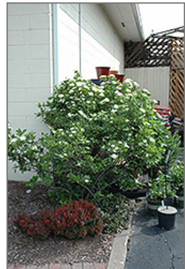
Winterthur Viburnum in bloom