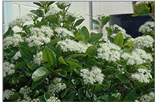
Winterthur Viburnum flowers

This is a relatively low maintenance shrub, and should only be pruned after flowering to avoid removing any of the current season's flowers. It is a good choice for attracting birds to your yard, but is not particularly attractive to deer who tend to leave it alone in favor of tastier treats. It has no significant negative characteristics.