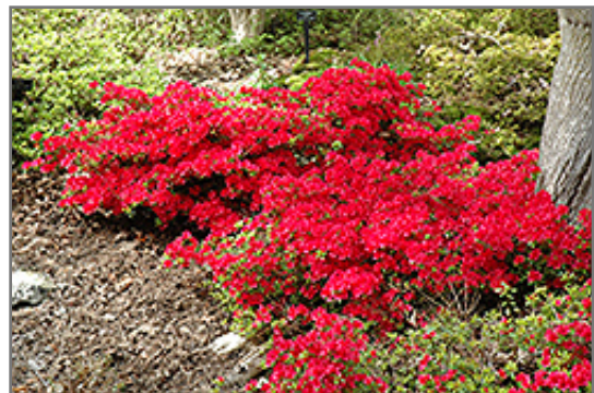
Hino Crimson Azalea in bloom