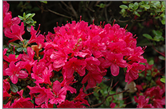
Hino Crimson Azalea flowers

This shrub does best in full sun to partial shade. You may want to keep it away from hot, dry locations that receive direct afternoon sun or which get reflected sunlight, such as against the south side of a white wall. It requires an evenly moist well-drained soil for optimal growth, but will die in standing water. It is very fussy about its soil conditions and must have rich, acidic soils to ensure success, and is subject to chlorosis (yellowing) of the foliage in alkaline soils. It is somewhat tolerant of urban pollution, and will benefit from being planted in a relatively sheltered location. Consider applying a thick mulch around the root zone in winter to protect it in exposed locations or colder microclimates. This particular variety is an interspecific hybrid.