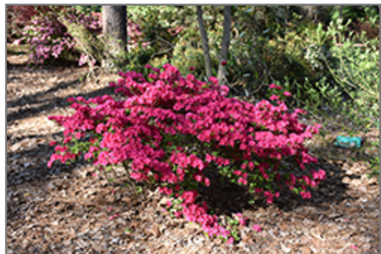
Girard's Fuchsia Evergreen Azalea in bloom