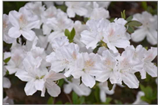
Delaware Valley White Azalea flowers