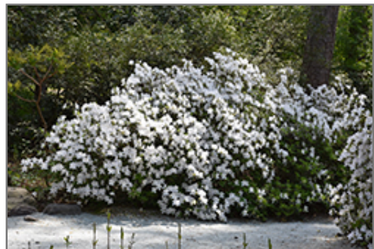
Delaware Valley White Azalea in bloom